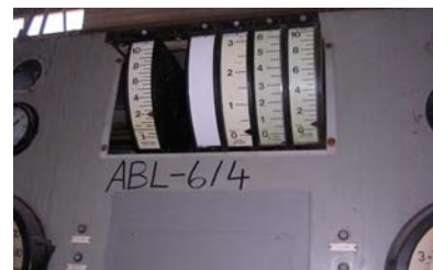
ABL-614 1. Boiler, Combination Control Panel

Consisting of: with furnace draft gauge, gas to air heater gauge, air from heater gauge, gas from air heater gauge, with superheater temperature gauge, % Co2 gauge, feedwater flow gauge, % loading gauge, meter max air flow meter, metermax furnace pressure meter, gas burner pressure gauge, steam drum-black gauge, micromhos per c.m. cube gauge, foxboro pressure recorder, metermax fuel feel meter, meter max master meter, with amps, position gauge, with circuit breaker controls, switches, steel enclosure, steel clad, indoor use