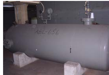
ABL-656 1. Tank, Air Receiver

Mfr: Richmond Engineering Co., Design: 125, Head Thick. Ins.: 3/8", Shell Thick. Ins. 5/16", HD Rating: 36, Length: 96, Diam.: 36, Max Work Temp.: 650