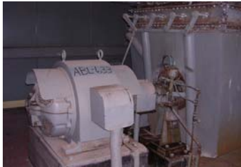
ABL-633 Fan, Multivane

Mfr: Sturtevant, Size: 7 1/2, Design: 6, SN: 158158, with Motor, electric - Linestart, Mfr: Westinghouse, Type: CS Induction Motor, HP: 150, constant speed, Frame: 772-S, Phase: 3, Cycle: 60, Volta: 440, Amps Per Terminal: 174, % Load: 100, RPM: 1175, Hours: 24, Deg C Rise: 40, Code: H, Style No.: 2N-8359, SN: 1S-2N8359