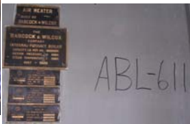
ABL-611 1. Boiler, Integral, Furnace

Mfr: The Babcock-Wilcox Company, Capacity, LB Per Hour: 100,000, design pressure, lb:700, steam pressure, F.:845, built: 1947, boiler: Mfr: The Babcock and Wilcox Co., Contract No.: F-1237, Design Pressure, lb: 700, H.S. Square Ft: 6998, Built: 1947, Water Cooled Wall: Mfr: The Babcock and Wilcox Co., Contract No.: F-1237, Design Pressure, lb: 700, H.S. Square Ft: 1510, Built: 1947, Natl. BD: 15400 H.S.B., Superheater: Mfr: The Babcock and Wilcox Co., Contract No.: SH*8090, Built: 1947, Design Pressure: 700, NB: 15400