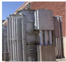
ABL-609 Abilene Plant Unit 4 Unit Auxiliary Transformer (434-2) Out of service and drained 3/25/2003, Moloney Transformer Serial # 855771, Type SPL, 3 phase, 60 cycle, 750 KVA continuous 55c rise, High Voltage 13200, Low Voltage 480, % Impedance 5.45, Gal Oil 455 gallons, Mfg. Date 4/30/48, Un-tanking Height 15 ft. 6 in., Un-tanking weight 4600 lbs., Tank & fittings 3300 lbs., Oil weight 3425 lbs., Total weight 11325 lbs.