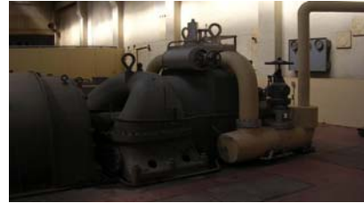
ABL-602 Steam Turbine

Mfr: Allis-Chalmers, Rated KW: 15,000, Initial Pressure: 600 PSIG, Capacity KW: 18,750, Initial Temperature: 825°F, Speed: 3,600 RPM, Exhaust Pressure: 2"HG-ABS, SN: 10490, with generator, alternating current, Mfr: Allis-Chalmers, KVA: 18,750 at 80% RF, Volts: 13,800, Amps Max: 785, Phase: 3, Cycles: 60, Temp. Rise - Stator 60°C, Rotor 85°C, Excitation - 250 Volts, 240 Amps, RPM: 3600, SN: 150471, with generator, direct current, Mfr: Allis-Chalmers, KW: 75, Volts: 250, RPM: 3,600, Amps: 300, Wound: Shunt, Type: ITC, Temp. Rise: 40°C winding at 55°C Comm., Exciter: 25 volts, 3.8 amps, SN: 152261