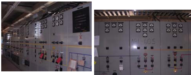
ABL-605 1. Switchgear, Panel board

Maker: Westinghouse, A.C. Generator, No information tag, Turbine has been removed