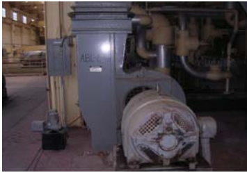
ABL-631 Fan With Motor

Turbovane Fan, Mfr: Sturtevant, Size: 995, Design: 2, SN: 518155, Motor, Mfr: Westinghouse, Type C S Induction Motor, Frame: 504-S, H.P.: 100, Volts: 440, Phase: 3, Cycle: 60, Amps per Terminal: 115, RRRPM at Full Load: 1780, constant speed, lock KVA code, Full Load: 100, Hours: 24, C Rise: 40, Style: 1441990, SN: 152N8358