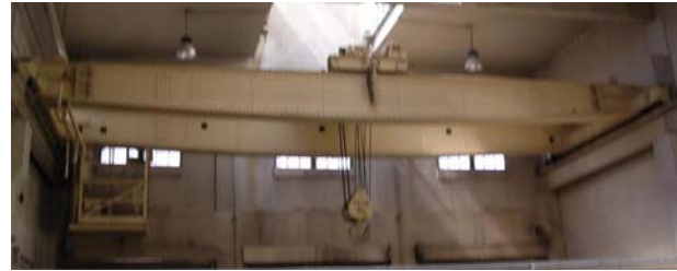
ABL-610 1. Crane, Trolley