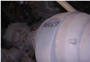
ABL-659 1. Pump, Centrifugal

Mfr: Ross Heater Co., Size: 1314CP, SN: 78370-2, Mfr Date: 02/24/1949, SN: none available