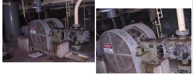
ABL-654 1. Compressor, Air

Service: plant air with compressor, air, Mfr: Ingersol-Rand, Type: 30T, Model: 15T, SN: 30T-594943 with motor, electric, Mfr: General Electric, HP: 15, Model: 5K326D191, Volts: 220/440, Code: F, Service Factor: 1.15, RPM: 1765