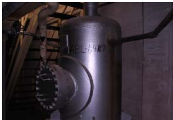
ABL-647 1. Drum, Boiler

Consisting of: 4 sections with 14 breakers, Service: Boiler Room Motor Control Center - Motor Control Center No. 3, with breakers-Westinghouse Starter - De-Ion Line Starter, Class: 11200/M.2, Mech. Style: 1221395-C, Westinghouse, steel enclosure, steel clad, indoor type, high voltage, Mfr: Westinghouse, Date: 1948