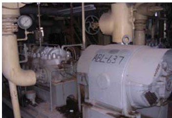
ABL-637 Pump and Motor Assembly

Service: Borler Feed Pumps, Mfr: Ingersol-Rand, Type: centrifugal pump, Size: 2 1/2RT-8, No, of Stages: 8, GPM: 249, Head Feet: 1860, RPM: 3575, Hydro Test: 1200psi, SN: 09483024 with Steam Turbine, Service: Boiler Feedwater, Mfr: The Terry Steam Turbine Company, HP: 182, RPM: 3550, Type: GS1, LBS Steam: 600psi, SN: 25125