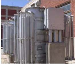
ABL-607 Abilene Plant Unit 3 Reserve Auxiliary Transformer (334)

Out of Service and drained 3/25/2003, Moloney Transformer, Serial # 855772, 3 phase, 60 cycle, Mfg. Date 4/30/48, 750 KVA continuous, 55c rise, Type SPL, High Voltage 13200 Low Voltage 480, Un-tanking Height 15 ft. 6 in. Gallons M-2 oil 455 gal., Un-tanking weight 4600 lbs, Tank & fittings 3300 lbs, Oil Weight 3425 lbs, Total Weight 11325 lbs