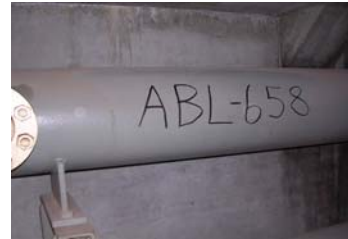
ABL-658 Cooler, Lubricating Oil 2 pass

Mfr: Allis-Chalmers, Steam Pressure: 300 psi gauge, Steam Temperature: 800°F, SN: AP-585, horizontal welded steel bolted ends, 2 pans-top and bottom sections