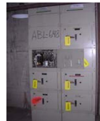
ABL-648 Switchgear Panel

Mfr: American Boiler and Tank Co, Size: 36" OD x 5' high S/S vertical welded steel, maximum wp: 400psi, maximum temp: 650°F, ASME: 3567, Head: 1500", Shell: .875", Year Built: 1948