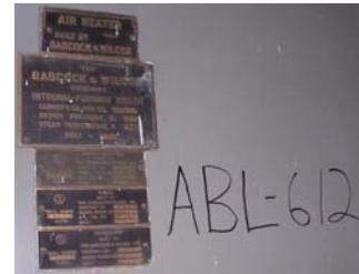
ABL-612 1. Boiler, Integral, Furnace

Mfr: The Babcock-Wilcox Company, Capacity, LB Per Hour: 100,000, design pressure, lb:700, steam pressure, F.:845, built: 1947, boiler: Mfr: The Babcock and Wilcox Co., Contract No.: F-1237, Design Pressure, lb: 700, H.S. Square Ft: 6998, Built: 1947, Water Cooled Wall: Mfr: The Babcock and Wilcox Co., Contract No.: F-1237, Design Pressure, lb: 700, H.S. Square Ft: 1510, Built: 1947, Natl. BD: 15400 H.S.B., Superheater: Mfr: The Babcock and Wilcox Co., Contract No.: SH*8090, Built: 1947, Design Pressure: 700, NB: 15400