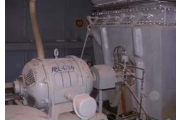
ABL-634 Fan, Multivane

Mfr: Sturtevant, Size: 7 1/2, Design: 6, SN: 518157, with Motor, electric - Linestart, Mfr: Westinghouse, Type: CS Induction Motor, HP: 150, constant speed, Frame: 772-S, Phase: 3, Cycle: 60, Volta: 440, Amps Per Terminal: 174, % Load: 100, RPM: 1175, Hours: 24, Deg C Rise: 40, Code: H, Style No.: 3N-8712, SN: 1S-3N8712