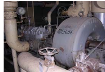
ABL-636 Pump and Motor Assembly

Service: Borler Feed Pumps, Mfr: Ingersol-Rand, Type: centrifugal pump, Size: 2 1/2RT-8, No, of Stages: 8, GPM: 249, Head Feet: 1860, RPM: 3575, Hydro Test: 1200psi, SN: 09483030 with motor, electric - Linestart, Mfr: Westinghouse, Type: CS Induction Motor, HP: 200, Frame: 607-S, Phase: 3, Cycle: 60, Volts: 440, Amps: 242.5, RPM: 3575, constant speed, Class: 1, Code: F, Style No.: 3N-8432, SN: 2S-3N8432