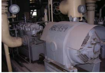
ABL-639 Pump and Motor Assembly

Service: Borler Feed Pumps, Mfr: Ingersol-Rand, Type: centrifugal pump, Size: 2 1/2RT-8, No. of Stages: 8, GPM: 249, Head Feet: 1860, RPM: 3575, Hydro Test: 1200psi, SN: 01483175 with motor, electric - Linestart, Mfr: Westinghouse, Type: CS Induction Motor, HP: 200, Frame: 607-S, Phase: 3, Cycle: 60, Volts: 440, Amps: 242.5, RPM: 3575, constant speed, Class: 1, Code: F, SN: Not Available, Tag Removed