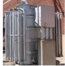
ABL-608 Abilene Plant Unit 4 Reserve Auxiliary Transformer (434-1)

Still in service as of 8-28-06, Moloney Transformer Serial # 857849 Mfg. Date 5/19/48, 750 KVA continuous 55c rise 3 phase 60 cycle Type SPL, High Voltage 4160 Low Voltage 480 Gal M-2 Oil 460 gal., % Impedance 5.4, Un-tanking Height 15 ft. 6 in., Un-tanking Weight 4400 lbs., Tank & fittings 3350 lbs, Oil Weight 3450 lbs, Total Weight 11200 lbs, Note: There is not a PCB-PPM sticker on transformer. Checked with T&D and their records show last test date of 2/13/1986 and 0 PCB-PPM.