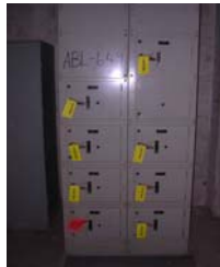
ABL-649 Switchgear Panel

Mfr: Westinghouse, Service: Boiler Room MCC 4-1, 2 sections with 7 breakers and starters, LineStarter - De-Ion - Size 1 with Westinghouse, steel clad, steel enclosure, high voltage, indoor type