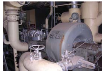
ABL-638 Pump and Motor Assembly

Service: Borler Feed Pumps, Mfr: Ingersol-Rand, Type: centrifugal pump, Size: 2 1/2RT-8, No, of Stages: 8, GPM: 249, Head Feet: 1860, RPM: 3575, Hydro Test: 1200psi, SN: 09483028 with motor, electric - Linestart, Mfr: Westinghouse, Type: CS Induction Motor, HP: 200, Frame: 607-S, Phase: 3, Cycle: 60, Volts: 440, Amps: 242.5, RPM: 3575, constant speed, Class: 1, Code: F, Style No.: 3N-8432, SN: 1S-3N8432