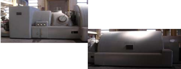
ABL-601 1. Turbine, Steam Generator

Mfr: Allis-Chalmers, Rated KW: 15,000, Initial Pressure: 600 PSIG, Capacity KW: 18,750, Initial Temperature: 825°F, Speed: 3,600 RPM, Exhaust Pressure: 2"HG-ABS, SN: 10490, with generator, alternating current, Mfr: Allis-Chalmers, KVA: 18,750 at 80% RF, Volts: 13,800, Amps Max: 785, Phase: 3, Cycles: 60, Temp. Rise - Stator 60°C, Rotor 85°C, Excitation - 250 Volts, 240 Amps, RPM: 3600, SN: 150471, with generator, direct current, Mfr: Allis-Chalmers, KW: 75, Volts: 250, RPM: 3,600, Amps: 300, Wound: Shunt, Type: ITC, Temp. Rise: 40°C winding at 55°C Comm., Exciter: 25 volts, 3.8 amps, SN: 152261