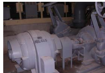
ABL-660 1. Pump, Centrifugal

Mfr: Allis-Chalmers, Size: 16" x 14" Type: SE, GPM: 5100, Head Feet: 65, RPM: 1170, Impellar: A-15-FV, SN: not available tag removed with motor, electric, Type: ARW, Mfr: Allis-Chalmers, HP:125, Code: F, Phase: 3, Cycle: 60, RPM: 1170, Volts: 440, Amps: 154, HRS: 24, Ambient: 40, SN: 16827MK-626DSW-1-1