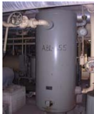
ABL-655 1. Tank, Air Receiver

Service: Instrument Air, Mfr: Ingersol-Rand, Type: ES-1, Year: 1947, Compressor Cylinder: 9" Bore x 9" Stroke, Discharge Pressure: 100psi, RPM: 325, SN: 80998 with motor, electric, Mfr: Delco, HP: 40, Model: 13-696-A, Frame: 404, Phase: 3, Cycle: 60, at 60 cycle: 220/440 volt, Amps: 96/48, RPM: 1760, Service Factor: 1.15, Cont. C Rise: 40 Deg, SN: 454R