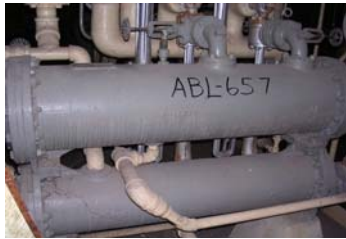
ABL-657 1. Pump, Steam Jet Air

Mfr: Buffalo Tank Corp, Size: 48" OD x 12' s/s long horizontal welded steel, Working Pressure: 125 psi, Working Temp.: 300°F, Natl. Board No.: 7741, S.t.: 34 HT: 40, H.R. 42948, H.S.B. No.: B183, coded, stamped and certified U69