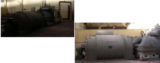
ABL-603 1. Turbine, Steam with Generator

Maker: Elliott Co., Rating: 7,500 KW, Speed: 3,600 RPM, Press: 600 LBG, High Press.: 825°F, IN. H.G. ABS: 2, SN:12783, Generator has been removed