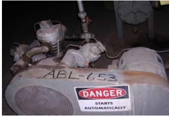
ABL-653 1. Compressor, Air

Service: plant air with compressor, air, Mfr: Ingersol-Rand, Type: 30T, Model: 15T, SN: 30T-594943 with motor, electric, Mfr: General Electric, HP: 15, Model: 5K326D191, Volts: 220/440, Code: F, Service Factor: 1.15, RPM: 1765