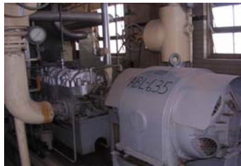
ABL-635 Pump and Motor Assembly

Mfr: Sturtevant, Size: 7 1/2, Design: 6, SN: not applicable tag removed, with Motor, electric - Linestart, Mfr: Westinghouse, Type: CS Induction Motor, HP: 150, constant speed, Frame: 772-S, Phase: 3, Cycle: 60, Volta: 440, Amps Per Terminal: 174, % Load: 100, RPM: 1175, Hours: 24, Deg C Rise: 40, Code: H, Style No.: 1N-3430, SN: 1S-1N3430