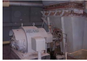
ABL-632 Fan, Multivane

Turbovane Fan, Mfr: Sturtevant, Size: 995, Design: 2, SN: 518155, Motor, Mfr: Westinghouse, Type C S Induction Motor, Frame: 504-S, H.P.: 100, Volts: 440, Phase: 3, Cycle: 60, Amps per Terminal: 115, RRRPM at Full Load: 1780, constant speed, lock KVA code, Full Load: 100, Hours: 24, C Rise: 40, Style: 1441990, SN: 152N8358