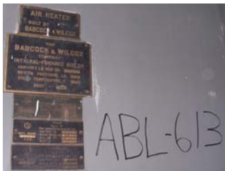
ABL-613 1. Boiler, Integral, Furnace

Mfr: The Babcock-Wilcox Company, Capacity, LB Per Hour: 100,000, design pressure, lb:700, steam pressure, F.:845, built: 1948, boiler: Mfr: The Babcock and Wilcox Co., Contract No.: F-1237, Design Pressure, lb: 700, H.S. Square Ft: 6998, Built: 1947, Water Cooled Wall: Mfr: The Babcock and Wilcox Co., Contract No.: F-1237, Design Pressure, lb: 700, H.S. Square Ft: 1510, Built: 1948, Natl. BD: 15400 H.S.B., Superheater: Mfr: The Babcock and Wilcox Co., Contract No.: SH*8090, Built: 1947, Design Pressure: 700, NB: 15400